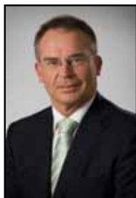
Jon Stanhope MLA Chief Minister