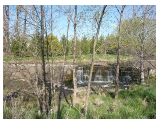
tunnel at Yarralumla Creek (sewerage tunnel forms part of the weir)