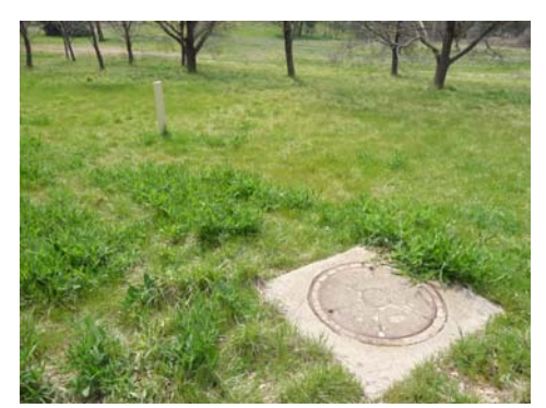
Access Chamber (feature # 37) in Stirling Park.