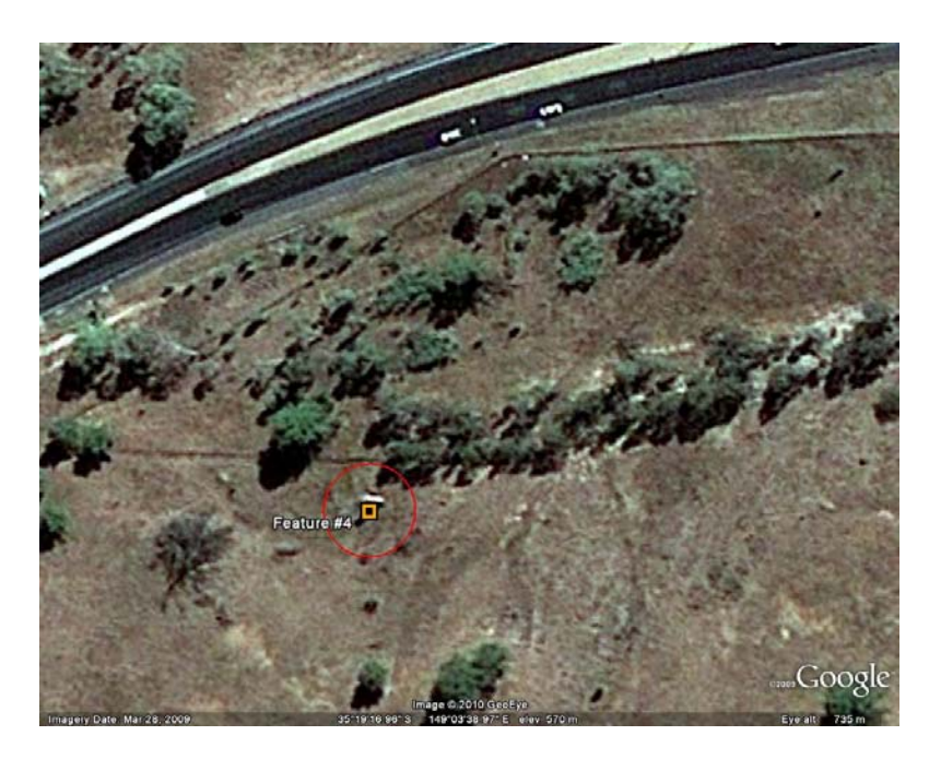
The Weston Creek Ventilator Shaft (feature # 4) is located at GDA 94 E687306 N6089341 A 10 metre boundary surrounds this GDA reference.