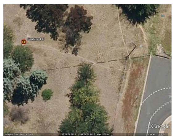
(feature # 37) GDA 94 E692192 N6091385 A 1 metre boundary surrounds this GDA ref.