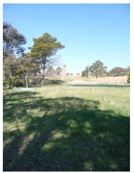
Ventilation Shaft (feature # 4)