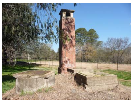
Ventilation shaft (feature # 22)