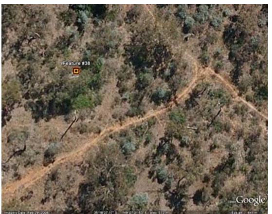
(feature # 38) GDA 94 E692473 N6091422 A 1 metre boundary surrounds this GDA reference.