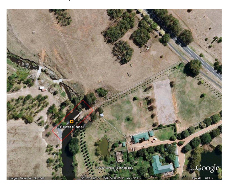
The tunnel crossing Yarralumla Creek is located at GDA 94 E688758 N6090528 The boundary surrounding this GDA point is shown above in red.