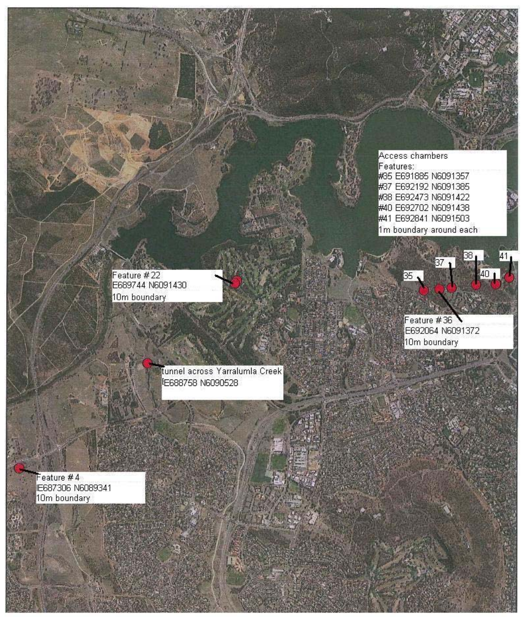
SITE PLAN Canberra's Main Outfall Sewer - location of features