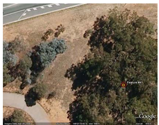
(feature # 41) GDA 94 E692841 N6091503 A 1 metre boundary surrounds this GDA reference.