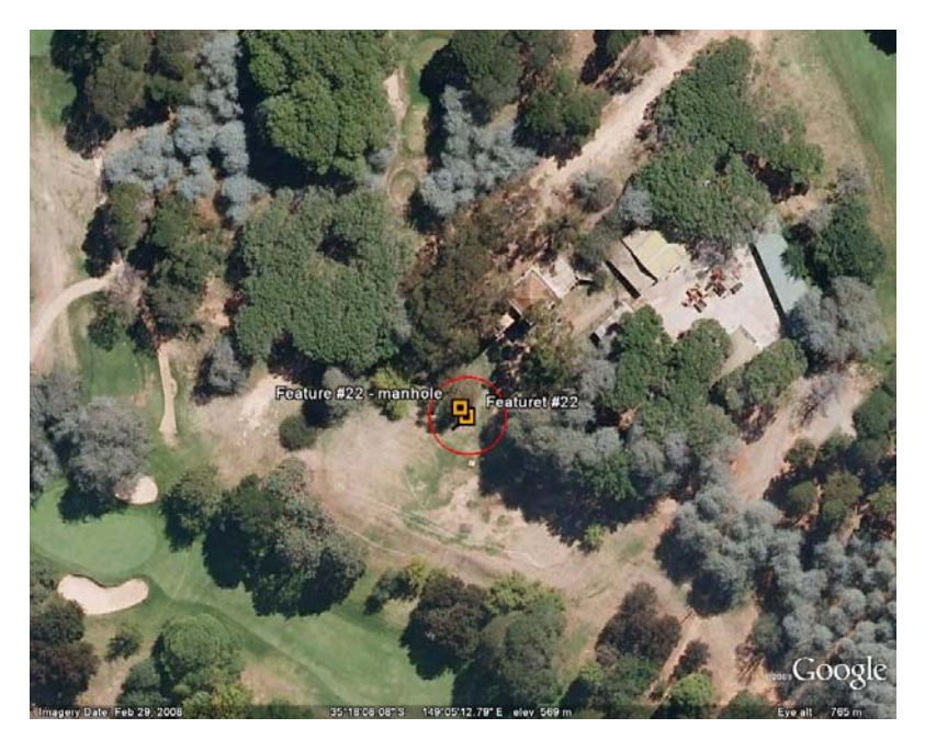
The Westbourne Woods Ventilator Shaft (feature # 22) is located at GDA 94 E689744 N6091430 A 10 metre boundary surrounds this GDA reference.