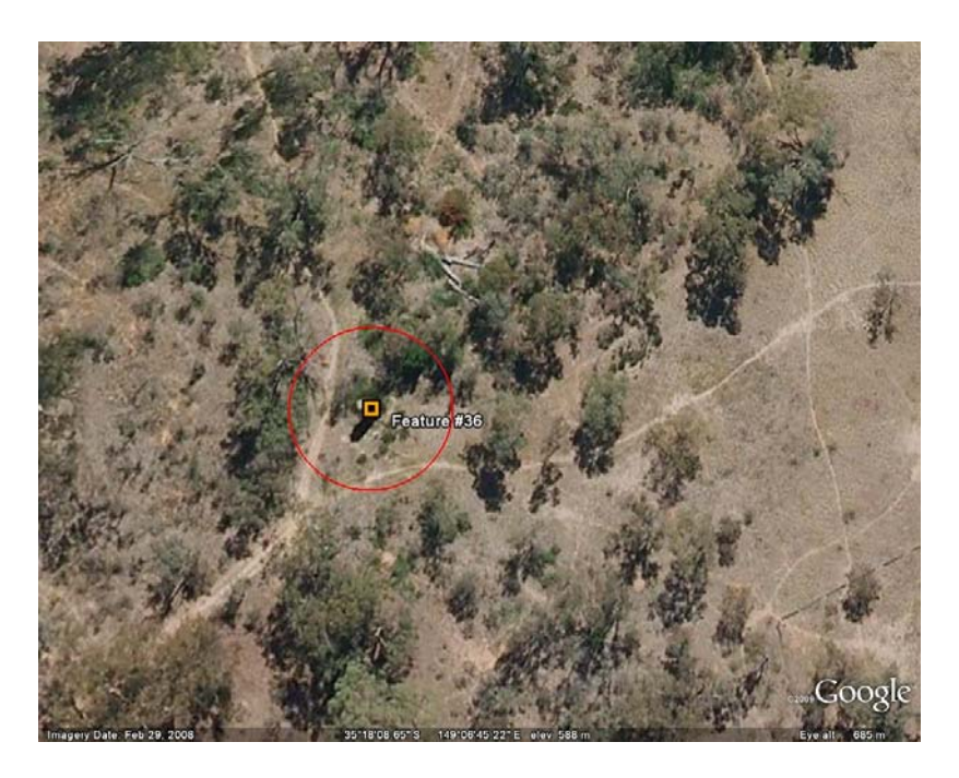
The Stirling Park Ventilator Shaft (feature # 36) is located at GDA 94 E692064 N6091372 A 10 metre boundary surrounds this GDA reference.