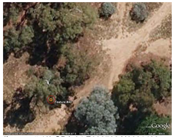
(feature # 40) GDA 94 E692702 N6091438 A 1 metre boundary surrounds this GDA ref.