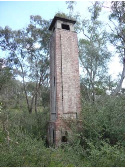
Ventilation shaft (feature # 36)