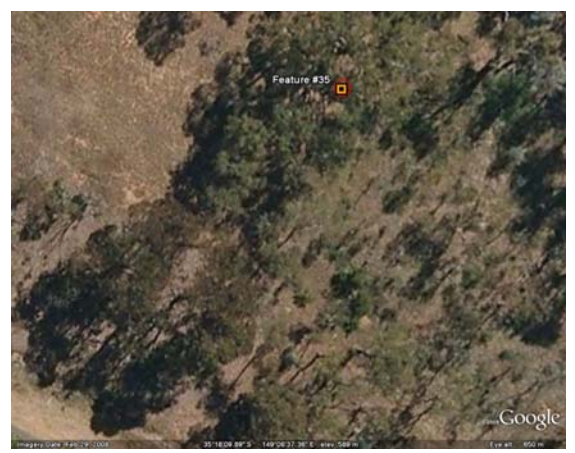
(feature # 35) GDA 94 E691885 N6091357 A 1 metre boundary surrounds this GDA reference.